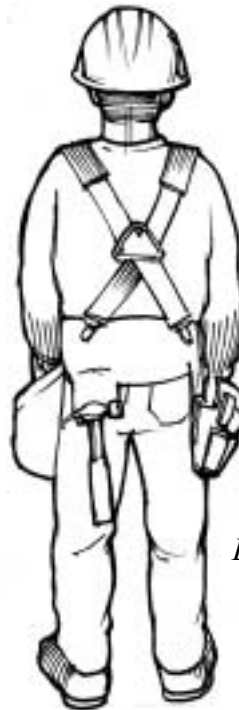
Balanced tool belt

Following these tips allows your spine to maintain good posture while supporting your tools.